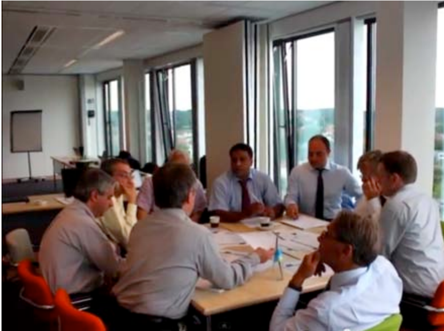
Figure 5: Group A Brainstorming Exercise