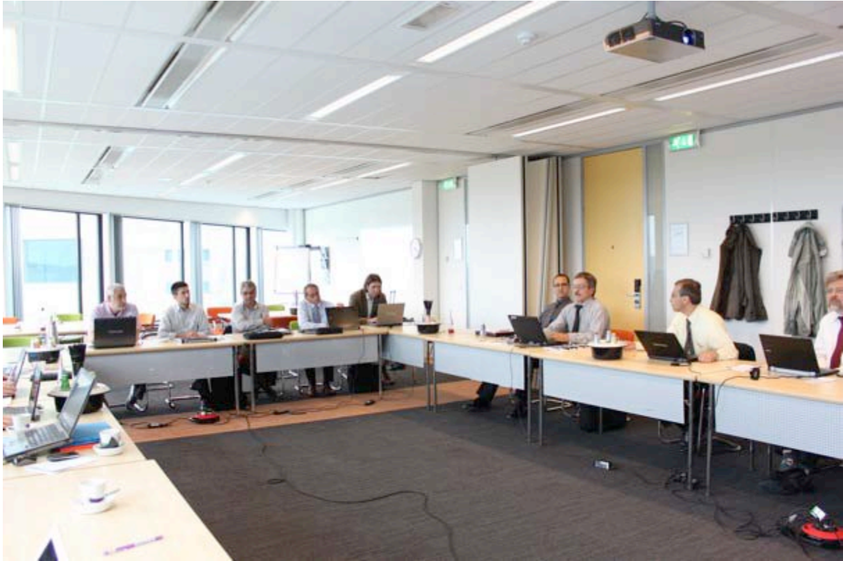
Figure 1: Plenary Session Discussion