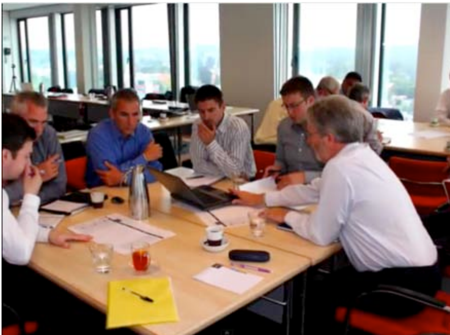
Figure 6: Group B Brainstorming Exercise