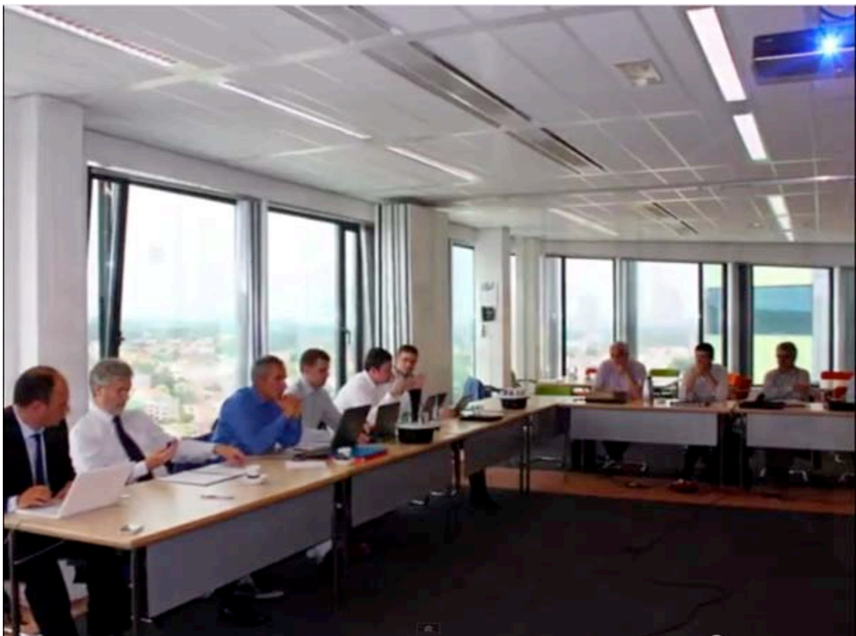
Figure 2: Plenary session discussion